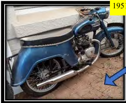
1951 Triumph Twin 350cc Bathtub Model, price of $6,500.

FOR SALE Call David on 0400 095 462 or aeconway@internode.on.net