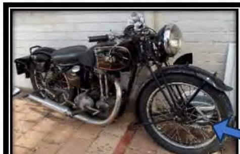
1938 350cc Model 16 AJS price of $9,000.

1965 Triumph Model TR6. Eng. No. TR6 DU28442 Regularly Ridden. But for little shed soiled will positively clean up well. Has been Historically Registered Asking around $10,500. Or V.N.O.