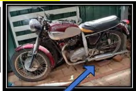
1965 Triumph 650cc Trophy, price to $9,000

1951 Triumph Eng. No. 51 A H9410 Lovely well-kept Bath Tub Model. Not Registered. Looking for around $8500. or V.N.O.